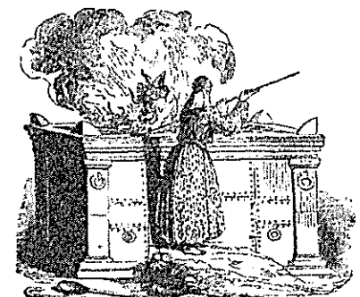
THE BRAZEN ALTAR.